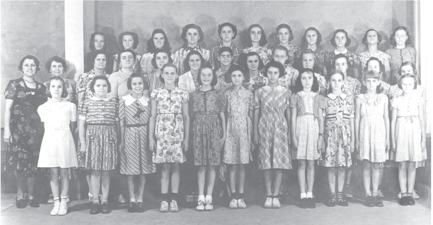
First Lititz Girl Scout Troop - 1938.