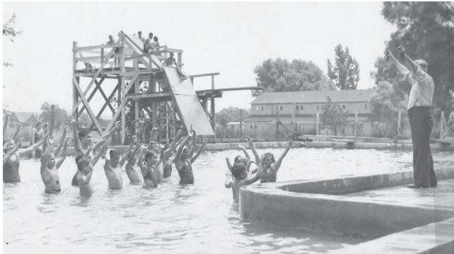
Lutz's Pool - Early 1930's.

Ask a few older "Lititzites" where they spent most of their long hot summer days, and chances are they will say Lutz's Pool. The pool was located at the northeast section of Locust Street, across from Woodstream Corp. Benjamin Lutz, who owned a meat market on Main Street and who was a very talented musician, built and operated Lititz's first public swimming pool in the early 1930's.