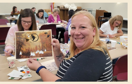
Thrifted Ghost Painting Class