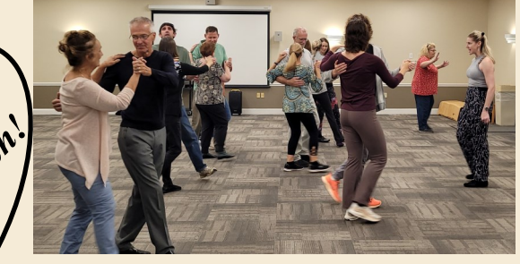
Ballroom Dance Class