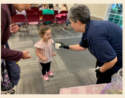
Ice Cream Social & Concert