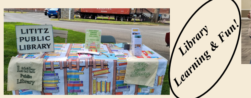
The Library at the Lititz Farmers Market