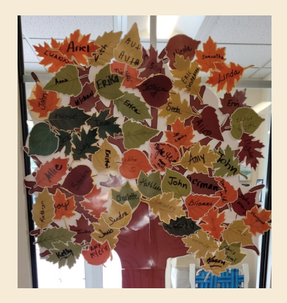
September is Library Card Sign-up Month. These are all new patrons.