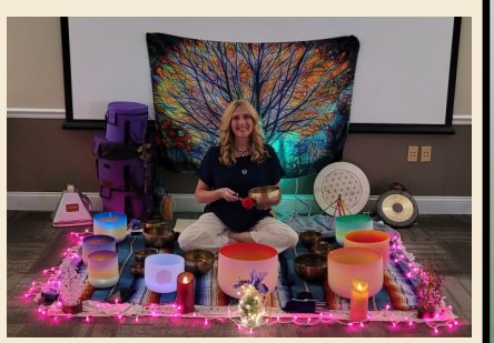
a 1551 at