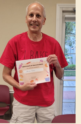
Winner of our 1st Annual