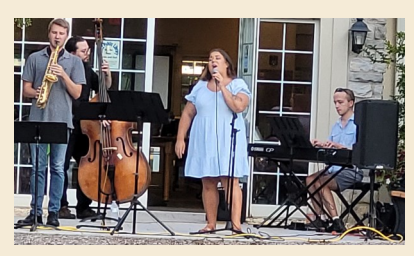
Outdoor Concert with Temple Avenue