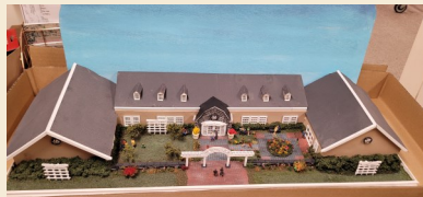
Russell Hogg created this fabulous model of the library for our 25th Anniversary Celebration.