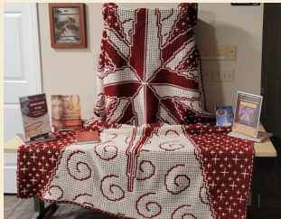
Moravian Star Program & Blanket Raffle.

Enjoy these photos of Anniversary Events that occurred in the past few months!