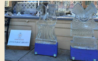
The library's sculptures at the Lititz Fire & Ice Festival.